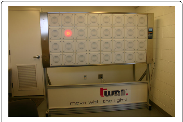
Fig. 3 The t-wall. The participant goes through a random sequence of striking 100 lighted buttons, one immediately after the other

out and another button lights until hit. This process continues for a random sequence of 100 buttons. When the last button is hit, all the buttons flash once to indicate that the test is complete. Participants are given a practice run on the t-wall to familiarize them with the process and the amount of force required in order to constitute a hit on any of the buttons. The starting position is standing an arm's length way from the center of the device. Initially, the first button of the 100 sequence is lit. However, the timing does not begin until the participant hits that first button. The measured