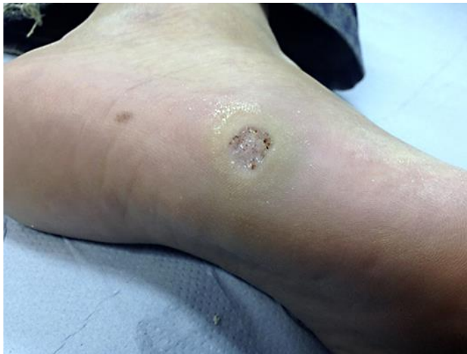
Fig. 2. Lesion at 3 weeks after treatment.