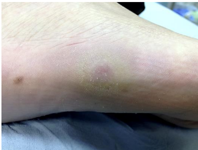
Fig. 3. Lesion at 5 weeks following 2 treatments.