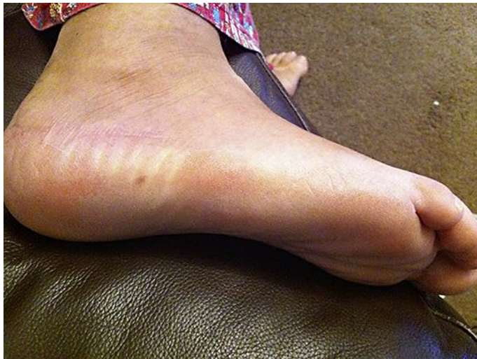
Fig. 4. Lesion resolved at second visit post-operatively.