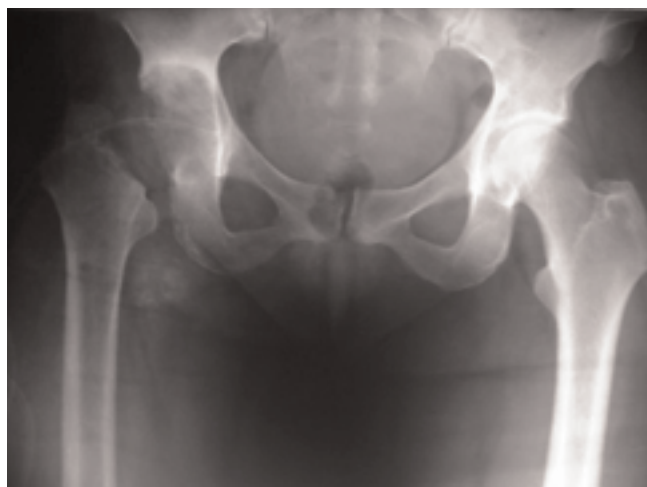
Figure 1a Hip x-ray showing severe destruction of periarticular bony destruction and deformity of the right hip.

Osteoarticular tuberculosis has become very rare in western countries, but it is still a common problem in under developing countries [3]. After the spine, the hip joint is the most common site of involvement for tuberculosis, and constitutes approximately 15% of all cases of osteoarticular tuberculosis [4]. The common age of presentation is in the second and third decades. In Stages II and III of the disease, the radiologic features are very obvious and diagnostic, and almost always predict the final clinical outcome. A progressive pattern of destruction of the hip occurs in patients who are not treated. Treatment including drainage of collections, and tuberculostatic drugs must be instituted early with an aim of salvaging the hip. Like observed in our patient, the earliest manifestation of tuberculous arthritis is pain, which precede signs of inflammation for months and occasionally years. Imaging studies initially may show soft tissue swelling but later demonstrate osteopenia, periosteal thickening, periarticular bony destruction, and progressive