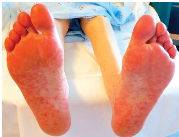
FIGURE 1. A macular rash on bilateral soles.