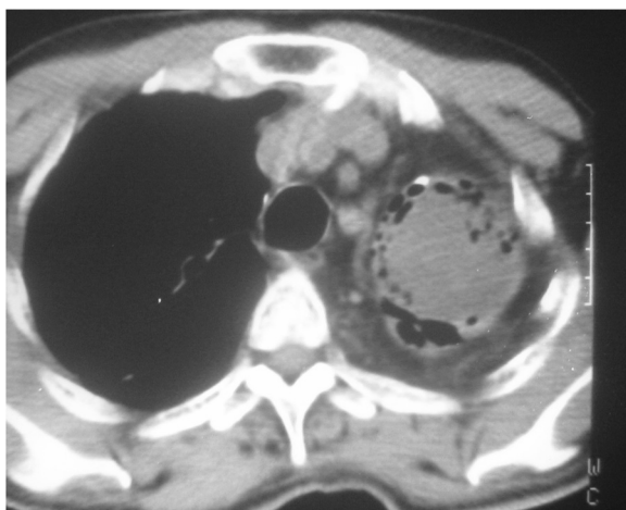
Fig. 2 Computed tomographic view of a complex aspergilloma of the left lung