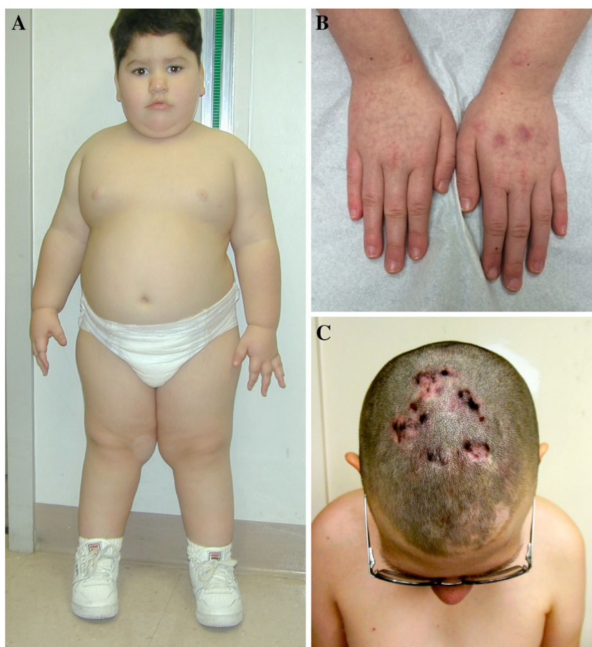
Fig. 1 a Obesity, almond shape eyes, down-turned mouth and straight borders of inner legs. b Straight borders of ulnar side of hands and scars from skin picking. c Active and healing skin lesions on scalp

paternally inherited deletion of the chromosome 15q11-q13 region. The remaining individuals have maternal disomy 15 (both chromosome 15 s received from the mother with no paternal chromosome 15 present) in about 25 % [9] of cases or have defects in the genomic imprinting center due to microdeletions or epimutations found in fewer than 3 % of cases [2, 4, 10, 11]. On very rare occasions, chromosomal translocations or rearrangements of the 15q11-q13 region are reported [2, 12–17].