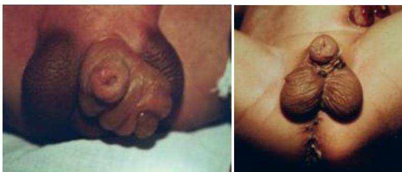
Fig. 6: Complete diphallia before (left) and after (right) operation

sides' normal meatuses, bifid scrotum, normal sized testes, imperforate anus and divided colostomy. U/S, IVP, VCUG and ureterography showed normal kidneys, ureters, bladder and other organs, but duplicated urethra and ended loop rectum.