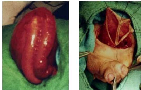
Fig. 1: Diphallus and duplicated colon and bladder

and ureters but duplicated bladder. A cystogram with retrograde filling through both urethras demonstrated two bladders without reflux and no connection between them (Fig. 1). Table 1 shows more specific information on this patient.