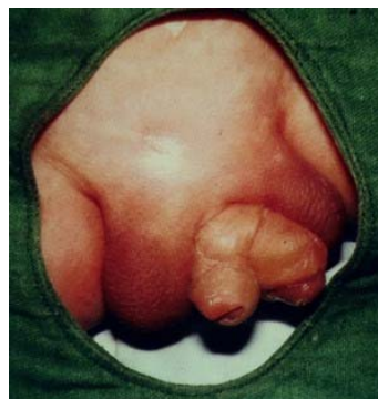
Fig. 4: Diphallia in case 4

Case 5: A 14-year old boy, the last of six children from an economically poor family. He had a history of difficult delivery and hypoxia. He was