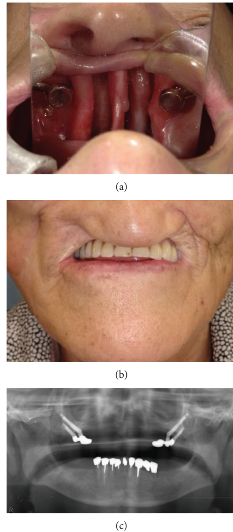
FIGURE 3: (a) Postoperative intraoral photograph (mirror image). (b) Intraoral view with the prosthesis in place. (c) Postoperative radiograph.

Maxillary defects caused by cancer ablative surgery are commonly reconstructed with prostheses. Good functional results are reportedly attained with obturator prostheses