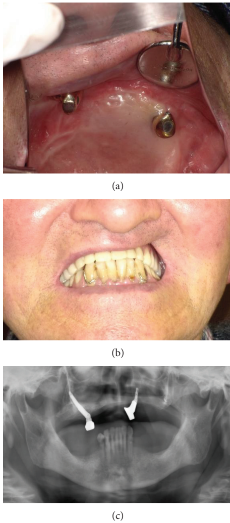
FIGURE 2: (a) Postoperative intraoral photograph (mirror image). (b) Intraoral view with the prosthesis in place. (c) Postoperative radiograph.

abutment with magnetic attachments was fractured. A new abutment with magnetic attachments was fabricated, and the prosthesis is currently being used without any complications (Figures 3(a)–3(c)).