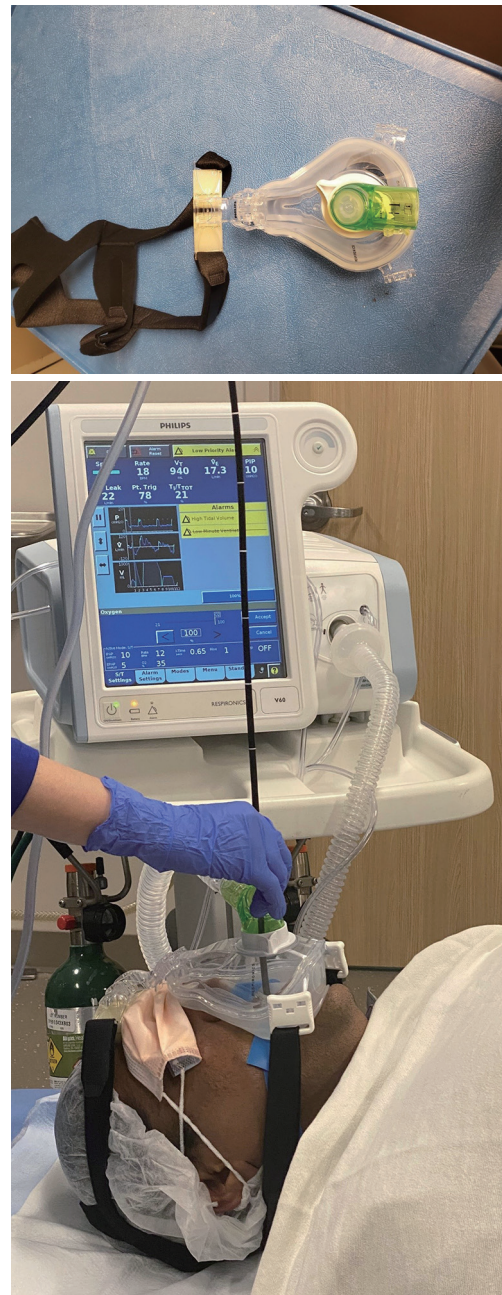
Figure 1 Non invasive ventilation mask.

A 50-year-old male with past medical history of hypertension, diabetes mellitus and acute myeloid leukemia with history of bone marrow transplantation presented with progressive shortness of breath. He was noted to be hypoxic on room air and required 2 L/min of oxygen via nasal cannula. CT chest showed bilateral ground glass opacities concerning for pneumonia. Despite broad spectrum antibiotics, his clinical condition continued to deteriorate and he started requiring 4 L/min of oxygen supplementation. Decision was made to do bronchoscopy to rule out opportunistic infections. Prior to bronchoscopy, the oropharynx was anesthetized with lidocaine spray. He was placed on NIV support with IPAP of 10 cmH 2 O and EPAP of 5 cmH 2 O. FiO 2 was increased to 100%. Thereafter, 50 mcg of fentanyl IV and 1 mg of midazolam IV was administered for moderate sedation. IPAP was titrated to maintain tidal volume of 400 and PEEP was increased to 10. After that bronchoscope was passed via the adapter, through the mask, and lidocaine was used to anesthetize vocal cord and tracheobronchial tree. A BAL was done from right middle lobe along with trans bronchial biopsies. No