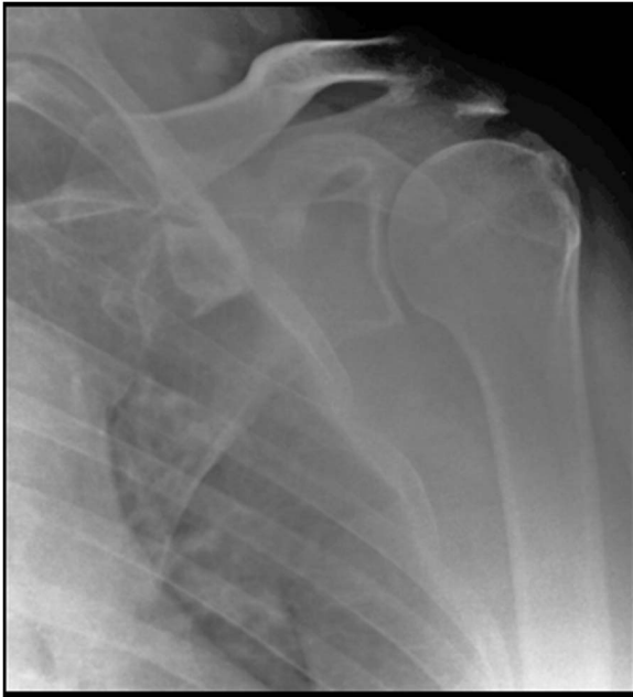
Figure 1 An adequate AP view meeting the evaluation criteria. Of particular note is the clear joint space between the glenoid fossa and the humeral head.

plane of the gleno-humeral joint, in fact, they deviate by only 1.8 degrees. 4 Once the above landmarks have been identified, the cassette is placed at 90 degrees to the line established and the x-ray beam is centred on the tip of the coracoid process with a 10 degree caudal tilt (Attachment 1 – Figure 2 ). 4 This ‘Fulcrum view’ has been shown to produce ideal AP radiographs which meet the criteria outlined previously. It also suggests that the overlap frequently seen on inadequate AP images is due to the lack of reliance on the superficial anatomical landmarks used to establish the joint line thus meaning the radiograph is not taken in the plane of the joint. 4