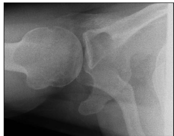
Figure 3 An adequate axillary view as per the evaluation criteria. Again, note the unobscured joint space between the humeral head and the glenoid fossa.

In the trauma patients mentioned above, an alternative axillary view, known as the Velpeau view, can be used and therefore reduces the need to cause the patient any pain. 7 It does this by allowing the patient to remain in the sling and does not require any shoulder