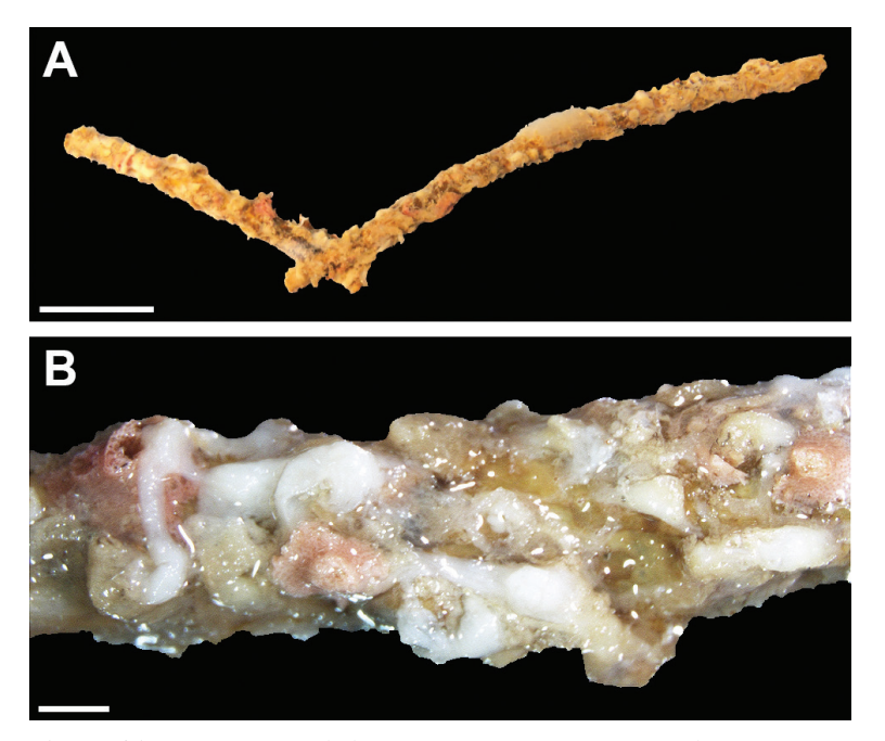
Figure 2. Altumia delicata gen. n. sp. n. holotype ZMTAU CO 37427. A Colony growing over a branch of a black coral B close up of holotype. Scale 10 mm at A , 1 mm at B .

large size (~45 cm in length) and can be predominantly fouled by A. delicata (Figure 3B). Interestingly, debris, such as PVC net found at a depth of 100 m, was found to be colonized by this octocoral (Figure 3C).