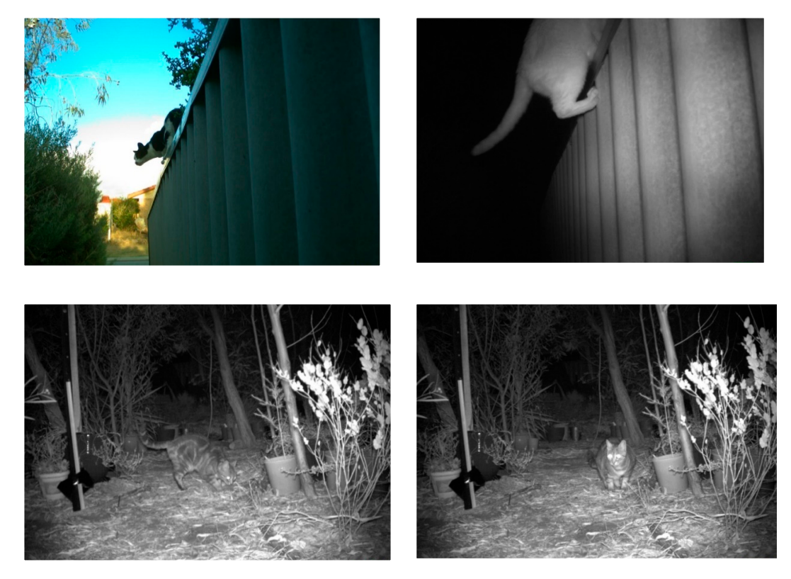
Figure 2. Evidence that free-roaming cats engage in nuisance activity on private properties. Top left and right: Two stray cats enter and exit the front yard of a private property by climbing over a boundary-fence. Bottom left and right: A stray cat defecates on a garden path in a suburban backyard. (in Western Australia, stray cats are any cat without a collar, etc. [191]).

The nuisance activity of roaming cats is regularly reported to councils (e.g., [21,46]) and fuels neighborhood disputes [189]. The nuisance activities of cats are particularly difficult to curtail considering their typical nocturnal activity patterns and ability to evade physical barriers and gain access to private property (Figure 2). In trials of ultrasonic cat-deterrents in suburban backyards in Perth, Australia, Crawford et al. [190] detected 78 'unwelcome' cats encroaching onto 17 private properties. These cats engaged in numerous nuisance activities, including defecating and urine scent-marking (Figure 2). Pairs of cats fought or played together, and 20 hunting events were recorded (at least four cats successfully caught prey). Approximately half (47%) of the nuisance cats appeared to be unowned (did not wear collars as is required by State legislation [191] or were not confirmed as belonging to a local resident), with at least 38% of unowned cats confirmed to be male. Even with novel deterrents, stray cats can exacerbate tensions between neighbors and caretakers, and this may increase complaints to local councils who may need to allocate funds to dispute resolution.