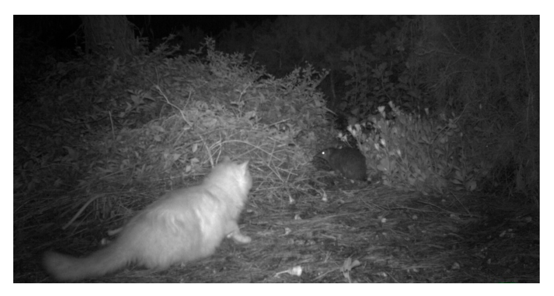
Figure 4. Evidence of cats conflicting with wildlife: a stray cat (in Western Australia, any cat without a collar, etc. [191]) stalking a quenda, an endemic species of bandicoot ( Isoodon fusciventer ) in an urban bushland reserve.