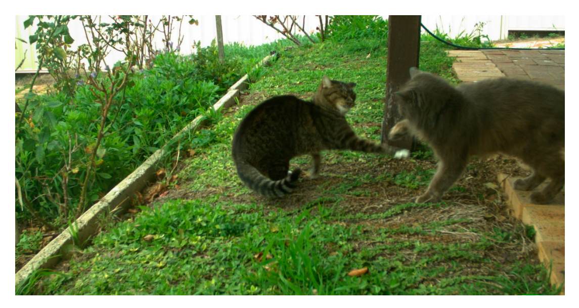
Figure 3. Evidence of cats conflicting with pet cats: a stray cat (any cat without a collar, etc., [191] in Western Australia) interacting with a pet cat in its owners' backyard (pet cat on left).

other cats (and dogs) significantly influenced the prevalence of parasitic infection [204]. Therefore, even if pet cats are regularly vaccinated and dewormed, TNR may increase urban cat densities overall and increase the likelihood of cats fighting and being exposed to common or novel pathogens.