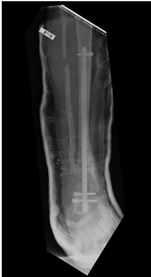
Figure 5. AP radiograph after hindfoot arthrodesis using the SIGN nail.

for ankle pain. [9] In a systematic review of TTC arthrodesis using an IM nail, Franceschi et al [4] found that the limb salvage rate was 90%.