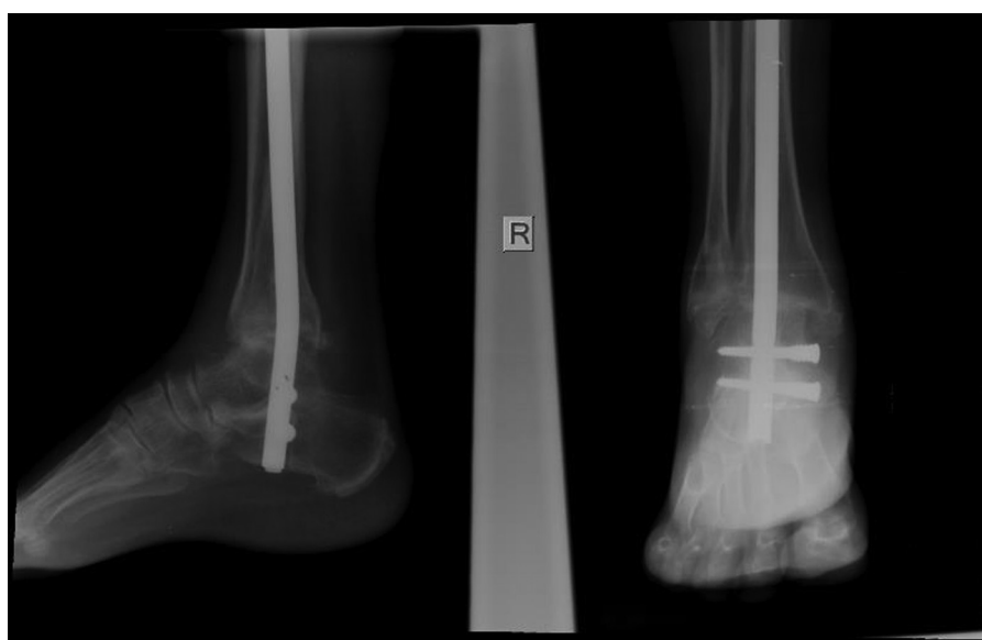
Figure 2. Anteroposterior and lateral radiographs of same patient after hindfoot arthrodesis using the SIGN nail. Note the apex posterior position of the Herzog curve assists in maintaining the ankle in neutral position. Since this patient had posttraumatic arthritis, the fibula was left intact, and the arthrodesis was prepared through the anteromedial approach.

Fifty-seven patients who underwent tibiototalcalcaneal arthrodesis under the supervision of one of the senior authors (DG, GKK) were identified. Twenty-two patients were female (39%) and 35 patients (61%) were male. The average age of patients was 44.3 \pm 14.3 years (range, 19–76). Twenty-five patients (44%) presented with injuries on the left side and 32 patients (56%) presented with