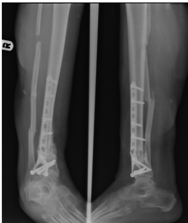
Figure 4. After attempted open reduction and internal fixation and bone grafting, anteroposterior and lateral radiographs demonstrate continued nonunion and fracture of the hardware. In this situation, the arthrodesis was prepared through the anteromedial approach.

right-sided injuries. Indications for the procedure are detailed in Table 1.