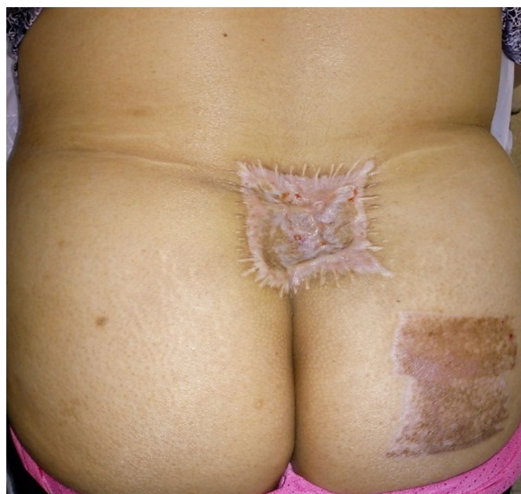
Fig. 3 View of surgical outcome at 6 months postoperatively

In the current literature, we found no consensus on the exact safety margins in wide excision; in fact, they range from 1 to 5 cm, and vary according to the site. Therefore, preoperative planning has a central role in avoiding inappropriate resection (positive margins), recurrence, and poor reconstructive outcomes of excision [12–21].