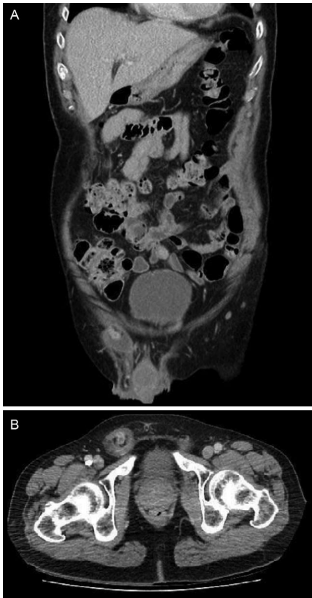
Figure 1: CT showing right inguinal hernia containing contrast filled appendix with dilated lumen, wall enhancement and free fluid within the hernial sac: (A) coronal view and (B) axial view.

The gold standard in managing inguinal hernias in the elective setting is with mesh hernioplasty to minimize the risk of hernia recurrence [4]. This presents a problem when managing Amyand's hernias where management of the appendix needs to be considered as well. The decision to perform appendectomy or the presence of appendicitis precludes the use of synthetic mesh due to the risk of mesh infection. Several cases have described the use of synthetic mesh in conjunction with copious wash and antibiotics [5]. The successful use of biological mesh also has been described [2].