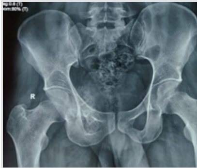
Figure 1: Radiograph at presentation.