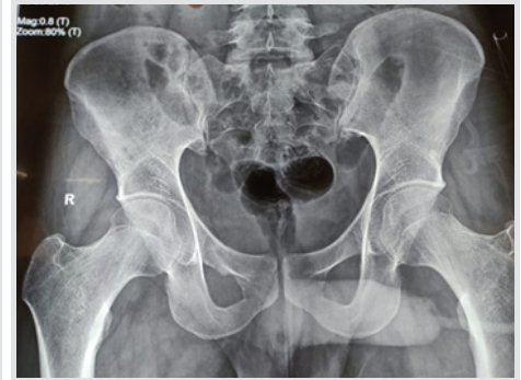
Figure 3: Radiograph post-operative.

X-ray pelvis with both hips anteroposterior view and oblique views (Fig. 1) showed exostosis arising from superior pubic rami. Non-contrast helical computerized tomography (CT) pelvis with both hips (Fig. 2) showed a pedunculated round to oval lesion in continuity with cortex of superior pubic rami on the right side arising from outside surface. It had a cartilaginous cap. It measured 8 cm × 4.6 cm × 5 cm in size. CT scan of pelvis confirmed the bony nature of swelling.