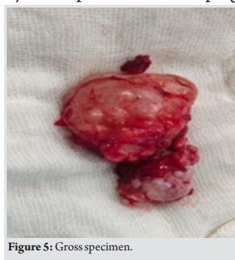
Figure 5: Gross specimen.