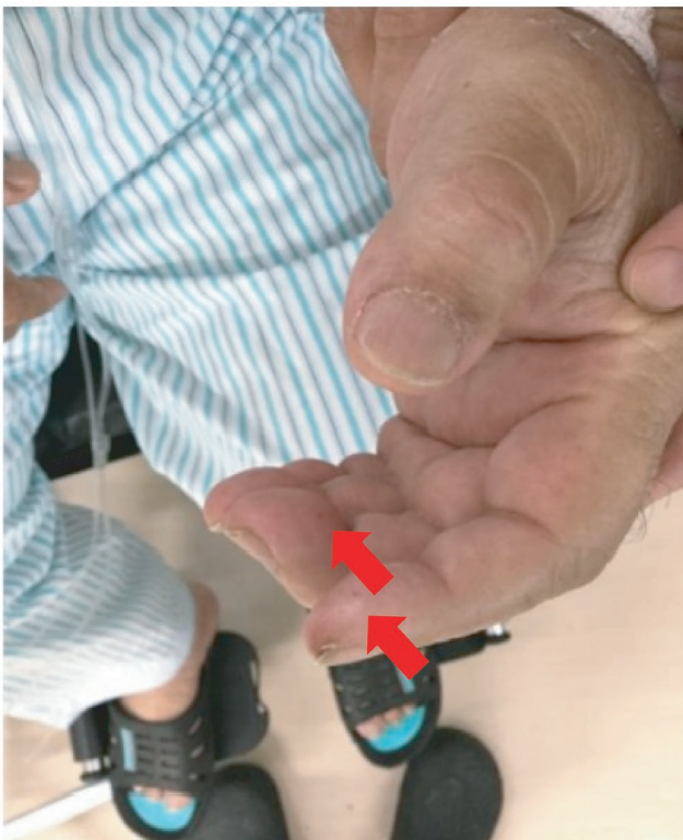
FIGURE 2 A photograph of the patient's hand. A small scar can be seen on the left hand, which may have been accidentally caused by a skewer (arrow)

On day 6, the patient's general condition improved, and CSF examination revealed improved pressure (16 cm CSF). Laboratory values also improved as follows: cell count, 44 cells/ \mu L; protein level, 84 mg/dL; and plasma glucose level, 180 mg/dL. On day 20, MRI showed improvement in ventriculitis, and penicillin G was administered for 22 days. After treatment completion, the patient showed no signs of recurrent meningitis and was discharged on day 40. Inner ear dysfunction did not improve, and cochlear implant surgery