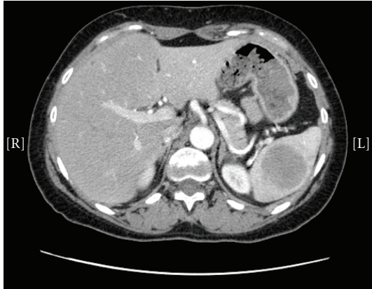
FIGURE 1: CT scan showing a 4.7 cm solitary splenic lesion.

lesion diagnosed a low-grade neuroendocrine carcinoma in keeping with metastasis of the resected lung primary (chromogranin, cam 52, panCK, MFF116, synaptophysin, CD56 positive; no necrosis; no mitoses; Ki67 labelling index < 5%). After a multidisciplinary discussion, a funding application for Lutetium 177 DOTATATE therapy was made. Prior to the commencement of this therapy, a repeat CT scan in September 2009 showed a decrease in the size of the patient's pleural deposits, but an increase in the splenic lesion to 5.8 cm. In view of the isolated progression of the splenic lesion, it was decided that Lutetium therapy would be more effective following a reduction in the tumour load by excision of the splenic mass. As a result, the patient underwent a laparoscopic splenectomy in November 2009.