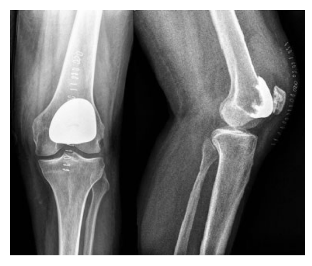
Fig. 1 Anteroposterior and lateral X-ray view after left PFA implants. PFA, patellofemoral arthroplasty.

The patella tracking should be carefully checked with trial components. If it is not adequate, a lateral release can be performed. In case of more severe malalignment, advancement of the vastus medialis or tibial tubercle transfer can be performed. However, these procedures should be carefully planned preoperatively, and worse outcomes can be expected.<sup>33,40</sup> When the correct size and position of the implant are achieved, the trial components are removed and the definitive components are cemented. Surgeons should be careful to avoid thermal damage to the adjacent cartilage during cementation ( -Fig. 1 ).