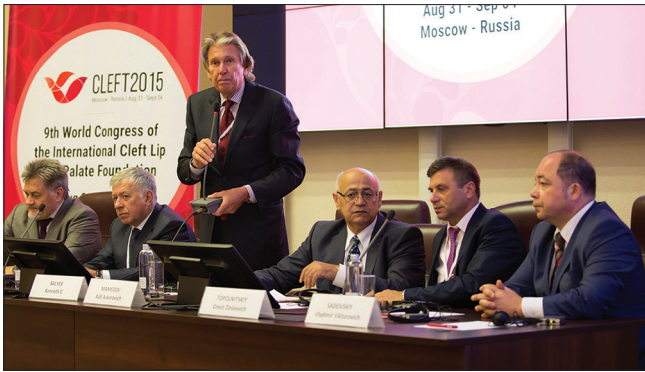
Figure 3: Prof Salyer delivering the Presidential oration at the International Cleft Lip and Palate Congress in Moscow in 2015