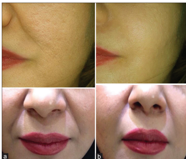
Figure 2: (a) Before treatment; (b) after treatment (subdermal injection of platelet-rich fibrin matrix)

using the SPSS software version 19.0 (SPSS Inc., Chicago, IL, USA), collected data were analyzed through paired t -test and independent t -test ( P < 0.5 ).