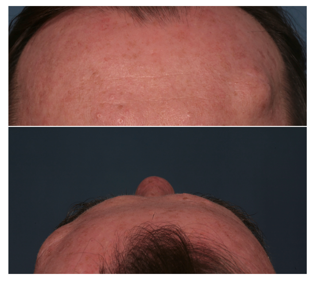
Fig. 1. Image of case report with hyperostotic mass. The hyperostotic bulge can be observed on the right (in the photo), left (for the patient) both in the frontal (top) and upper transversal (down) images.

Post-op was normal, no side was detected, in 3 days the patient was discharged with a small increase in the major inflammatory serum markers (ESR from 8 mm/h to 32 mm/h, CRP from 4 mg/L to 9 mg/L,