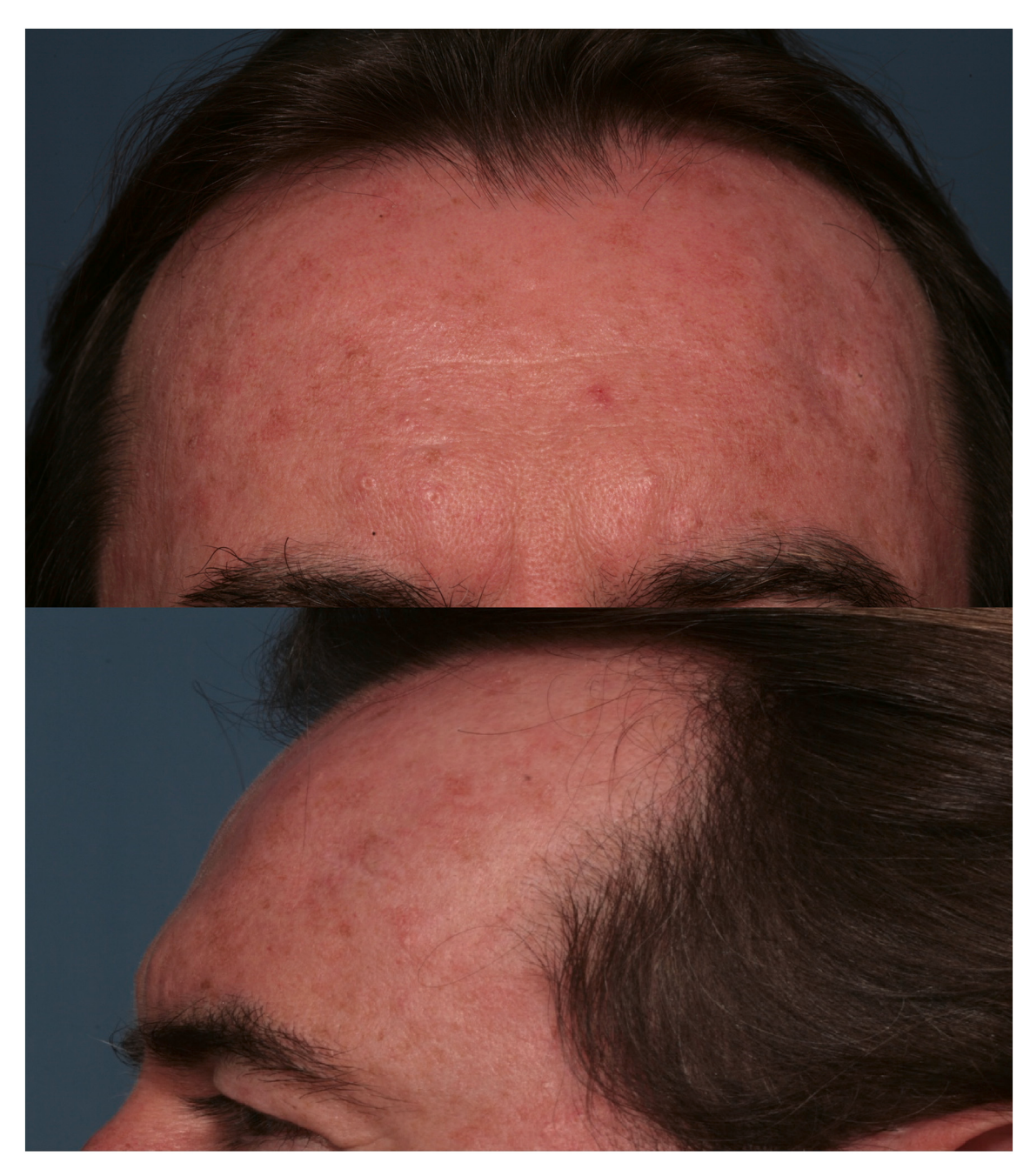
Fig. 4. Post-op photos of the case report: Top: Frontal image, down: lateral image. The hyperostotic mass is disappeared.

and osteoplasty, which requires the use of micro-vibrations of ultrasonic frequency scalpels. The principle of piezosurgery is ultra sound (US) transduction [22], obtained by piezoelectric ceramic contraction and expansion. The vibrations are amplified over the bone and results in the presence of irrigation with physiological solution, in the cavitation phenomenon, with a mechanical cutting effect exclusively on mineralized tissues, preserving soft tissues (such as periostium) from injuries, and thus enhancing a faster recovery [23]. Periostium provides blood supply which is fundamental for bone integration of the autologous graft and to avoid peri-operative complications, such as infections, dehiscence and delayed wound healing [24].