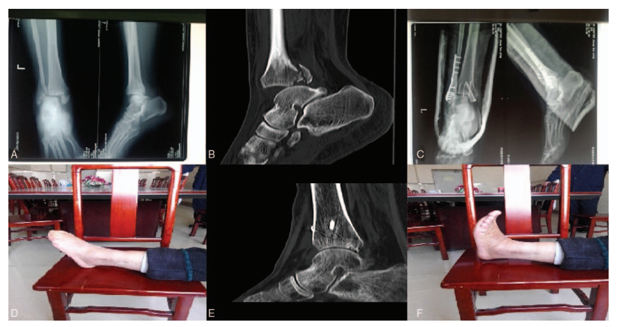
Figure 2. X-ray photograph and CT examination of one patient before and after the ankle joint dislocation. (A) X-ray photograph before the ankle joint dislocation; (B) CT examination before the ankle joint dislocation; (C) X-ray photograph after the ankle joint dislocation; (D) ankle flexion activity one year after the ankle joint dislocation; (E) CT examination 7 months after the ankle joint dislocation; (F) ankle extensor activity one year after the ankle joint dislocation. *The patient was female and 58 years old. Sprain led to swelling and pain of right ankle and she was admitted to hospital 2 day after limiting of activities. CT=computed tomography.

No loosening, prolapsed, and broken situation occurred in internal fixation of all cases. All cases had no obvious symptoms of traumatic arthritis of ankle joint (Fig. 2). Six cases expressed that the ankle joint appeared pain symptoms after a large number of activities, which can relief after rest. X-ray photograph showed no obvious signs of traumatic arthritis of ankle joint. Thus, this may be caused by soft tissue adhesion around ankle. After physical therapy and functional exercise for 3 months, the symptoms of 2 cases basically disappeared, the symptoms of 3 cases remitted obviously, and the pain of 1 case was reduced. Ankle joint activity of 28 cases can meet the needs of normal activities, while 2 patients were slightly limited when squatting.