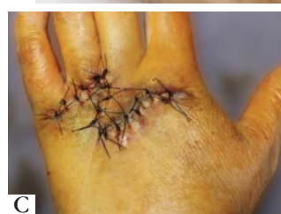
FIGURE 3: A - Marking lesion to be removed. B - Removal of injuries and surgical defects caused. C - Flap positioned