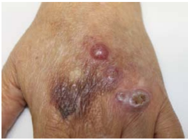
FIGURE 1: Violet Erythematous nodule and 2 other exulcerated erythematous papules on the back of the left hand

The other two lesions were also removed and the wound was closed with a double advancement flap (Figure 3).