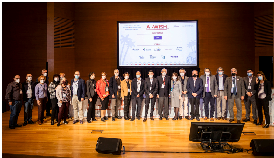
Fig. 8. Executive, Organizing, and Scientific Committees with speakers and awardees.