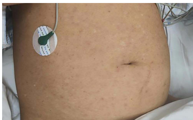
Figure 1 Petechial rash on the abdomen.

Laboratory analysis revealed a marked increase in C-reactive protein (CRP) (161.35 mg/L), procalcitonin (0.66 ng/mL), alanine transaminase (114.2 IU/L) and aspartate transaminase (175.6 IU/L); a marked decrease in eosinophils (0.00 x10 9 /L) and PLT (62 x10 9 /L); and abnormal WBC (4.90 x10 9 /L), NE (4.27 x10 9 /L), L (0.466 x10 9 /L), IL6 (154.03 pg/mL), IL10 (18.29 pg/mL), ALB (31.2 g/L), and BNP (270.35 pg/mL). A computed tomography (CT) scan of the chest revealed localized thickening and adhesion of the right pleura and a small amount of bilateral pleural effusion (Figure 2). The rest of the laboratory tests were negative, and image examination showed no abnormalities. Atypical pathogenic bacterial infection was suspected. Because of the lack of eschar, her blood was tested by mNGS, and the results of the mNGS on September 2 showed that Rickettsia japonicum (genus Rickettsia relative abundance 82.7%, sequence 36. species Rickettsia japonicum , confidence level 99%, sequence 3). No other disease-causing viruses or bacteria were found in the report. The patient was diagnosed with Japanese spotted fever and treated with doxycycline (first dose 0.2 g, 0.1 g bid po sequential treatment) and antishock treatments. The patient's general condition was good on September 7 (Figure 3 and Table 1). During the follow-up period, the patient did not complain of discomfort, and laboratory tests did not reveal any abnormalities.