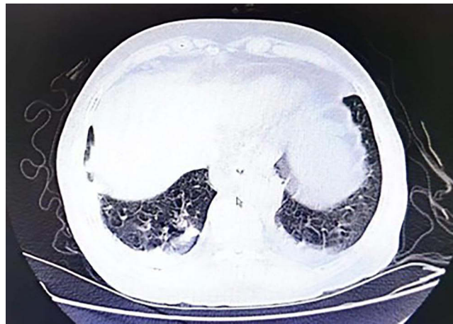
Figure 2 CT revealed localized thickening and adhesion of the right pleura and a small amount of bilateral pleural effusion.