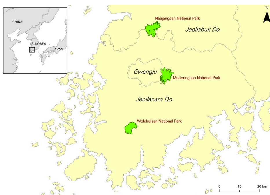
Figure 2. The research site: Three national parks in southwestern Korea.

and strengthen visitors' environment-friendly perception and behavior. Figure 2 provides the research area of the study.