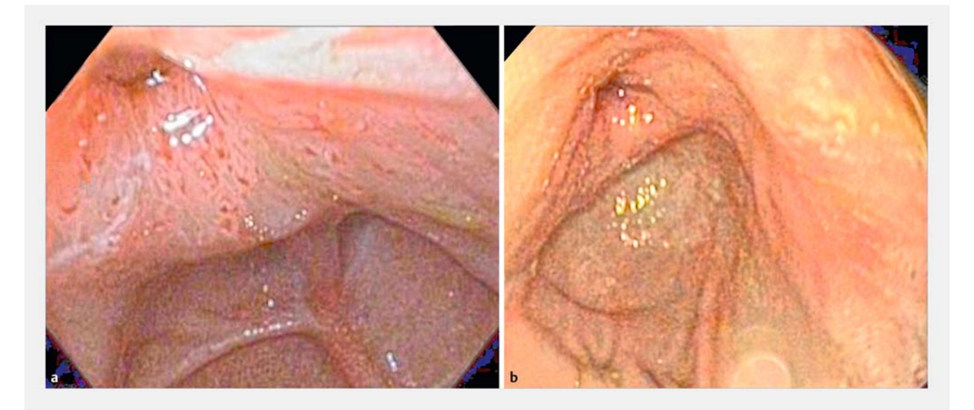
Fig.3 a Endoscopic view of antropyloric area of a patient around 8 weeks after caustic ingestion showing eccentric pyloric narrowing at 11 o'clock. b Endoscopic view of clinical success achieved in the same patient, with absence of residue and adequately dilated pyloric opening after five sessions of EBD.

► Table 3 Outcome of patients with refractory strictures given steroids versus those not given steroids.