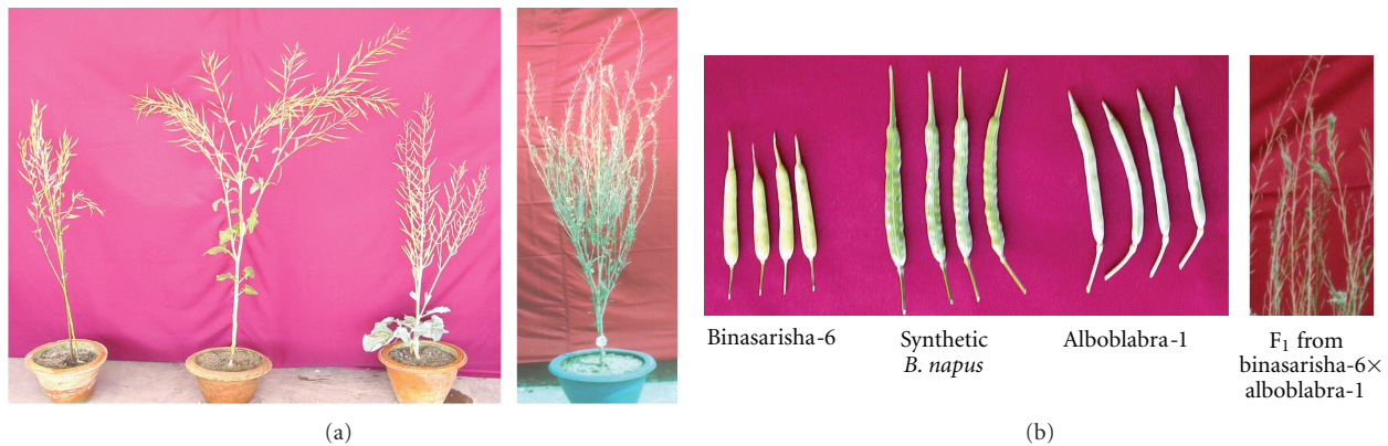
FIGURE 2: (a) Plants of Binasarisha-6, synthetic B. napus , Albolabra-1, and F 1 , and (b) siliqua of Binasarisha-6, synthetic B. napus , and Albolabra-1, and rachis without siliqua in F 1 .

weeks of treatment, though growth and development was started, but even then their growth was very slow. The new shoots emerged from the colchicines-treated leaf axils displayed thick and deep green leaves indicating the first symptom of induction of chromosome doubling. The highest chromosome diploidization (84%) was achieved with 0.15% colchicine treatment followed by 0.2% (72%) and 0.1% colchicine gave 60% success. Inhibited growth and development in colchicine treated tissues in Brassica hybrids was also reported by Aslam et al. [21]. The results indicated that chromosome diploidization rate differed with the concentration of colchicine, which showed close agreement with the results of Aslam et al. [21]. It has also been reported that success in chromosome doubling differs with method of application, different conditions, duration of treatment, and