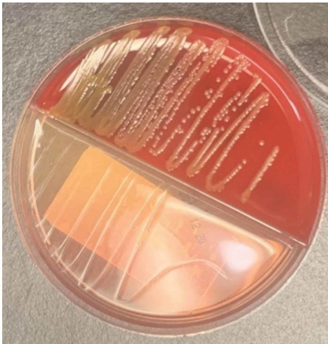
FIGURE 2: Subculture of isolated C. indologenes in blood agar (red) and MacConkey agar (clear).

C. indologenes grows yellowish orange colonies in blood agar.