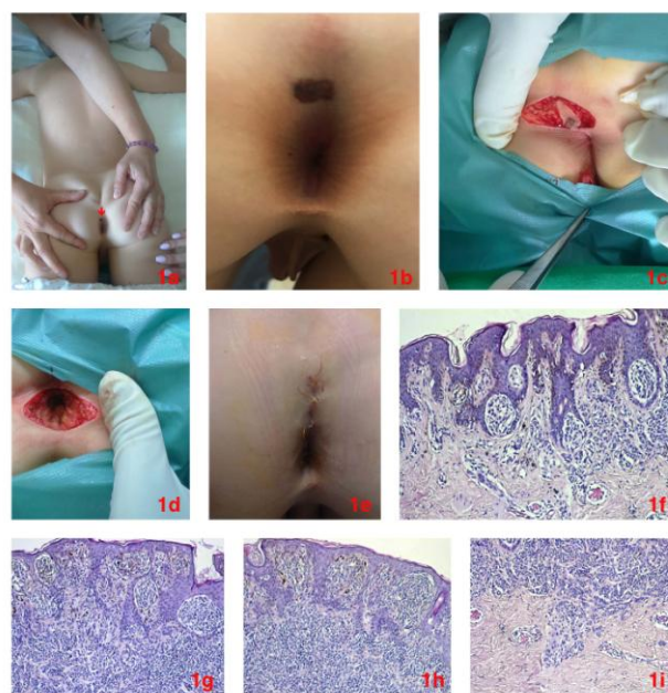
Figure 1: a, b - Clinical presentation of irregularly bordered pigmented lesion, location in rima ani in an 8 - year old male patient, clinically and dermoscopically suspicious for malignant melanoma; c, d – Intraoperative findings. Surgical excision of the lesion; f, g, h, i – Histological findings. Compound melanocytic lesion with the irregular architecture of the junctional component, with mild cytological pleomorphism, lentiginous hyperplasia and variably sized and shaped nests (1f to 1h). However, maturation of the intradermal component is adequate (1i)

The dermoscopic findings and clinical appearance of both lesions were suspicious for malignant melanoma. An enlarged lymph node was detected on palpation in the right inguinal fold. Laboratory blood tests examination did not reveal any significant abnormalities. The enlarged lymph node was confirmed by ultrasonography, revealing a 7.4/3.3 mm in diameter lymph node in the right inguinal fold, with preserved structure. No additional enlarged lymph nodes were detected in the left inguinal or axillary folds. Abdominal ultrasonography did not reveal any pathological abnormalities. The lesions were surgically removed with elliptic surgical excision under general anaesthesia and safety margins of 0.8cm (Fig. 1 c, d).