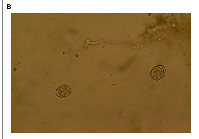
FIGURE 3 | (A) Lesions in the small intestine of a 37-day-old chicken, associated with Eimeria parasites. (B) Eimeria acervulina oocysts found during microscopic examination of jejunal contents from a 37-day-old chicken.

interaction with membrane components and permeability (48). If the carvacrol concentration increases, then more molecules interact with the phospholipid bilayer, upsetting membrane fluidity (49). Accordingly, carvacrol, thymol, and allicin, the major bioactive ingredients of the mixture tested here, may also exert a toxic effect on the upper layer of mature enterocytes of the intestinal mucosa. For this reason, we also assessed their cytotoxic effect in vitro and found it to be very low. Moreover, other studies have demonstrated that MDBK cells are able to produce cytokines when stimulated by exposure to viruses, suggesting that an immune response could also be involved in the anticoccidial effect of these metabolite compounds of oregano and garlic (10, 50).