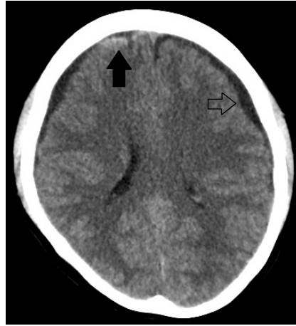
FIGURE 1: Nonintravenous contrast enhanced brain CT demonstrates bilateral CSF-density subdural hygromas (left subdural hygroma labelled with an open arrow) and a hyperdense acute right frontal subdural hematoma (solid arrow).