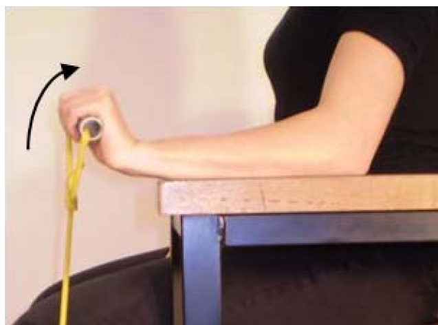
Figure 4 Progressive resistance exercise for wrist extensors using Theraband™.

Participants will be evaluated by a blinded assessor at baseline, 4, 8, 12, 26 and 52 weeks following randomisation. The 4 and 8 week time points will be used primarily to investigate the short term effects of corticosteroid injection.