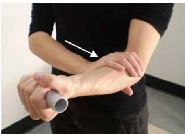
Figure 2 Retraining of gripping using self-applied lateral (Mobilisation with Movement) glide.

All participants will receive standardised advice regarding activity modification and pain management at the commencement of the study, in the form of a printed pamphlet and verbal assessment of their understanding of its contents. They will be advised that complete rest is detrimental to chronic musculoskeletal disorders and activity that does not cause elbow pain should be encouraged.