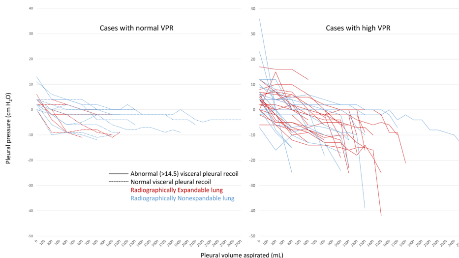
Figure 2 Pleural elastance curves of expandable versus non-expandable lungs. VPR, visceral pleural recoil.

colleagues considered both overall pleural elastance and terminal elastance in patients with a biphasic elastance curve. In contrast, our series focused only on terminal elastance. Chopra and colleagues also used a more stringent definition of radiographic re-expansion than the present investigation, requiring 90% pleural apposition on post-thoracentesis chest radiograph compared with 75% in this study. The 75% threshold used in the current work was chosen to align with that used to define eligibility in recent major trials including IPC-PLUS, 5 but might have resulted in some patients being labelled radiographically expandable that would have been labelled non-expandable at the 90% apposition threshold used by Chopra and colleagues, with impact on the rates of observed radiographic–manometric discordance. Our study describes the relationship between expansion by post-procedure thoracic ultrasound and terminal elastance, not included in the prior work, which produced similar findings as chest radiograph data. Our study also included non-malignant effusions; although pleurodesis is most commonly performed in the setting of malignant effusion, it remains an option for select recurrent symptomatic non-malignant effusions and therefore our finding that substantial radiographic–manometric discordance