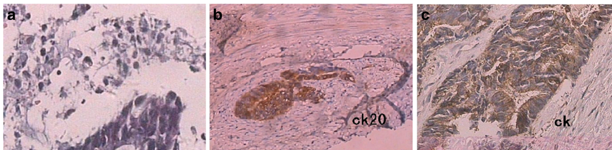
Figure 1 Pathological findings of patient in 2010. (a) On 13 March 2010, a lesion was removed from the left groin and pathology indicated lymph node metastasis. (b) On 6 August 2010, a perianal lesion from the left anterior anal wall was removed and pathology indicated adenocarcinoma (CK20 + ). (c) On 11 November 2010, perianal tumors were resected (CK + , CEA + ). CEA, carcinoembryonic antigen; CK, cytokeratin.

dosage received, as this is a multidisciplinary decision [15,16], whereas the use of adjuvant chemoradiation is based on clinical evidence. The minimum resection margin has not been well defined. A previous study suggested that a palliative resection (R1 to R2) of the LR is unlikely to benefit the majority of patients [17]. Symptomatic patients might be offered radiotherapy, otherwise treatment depends on the burden of disease and whether it is only local or disseminated; a complex issue that needs to be addressed at multidisciplinary level. Chemotherapy should be recommended to patients with severe metastatic conditions [9].