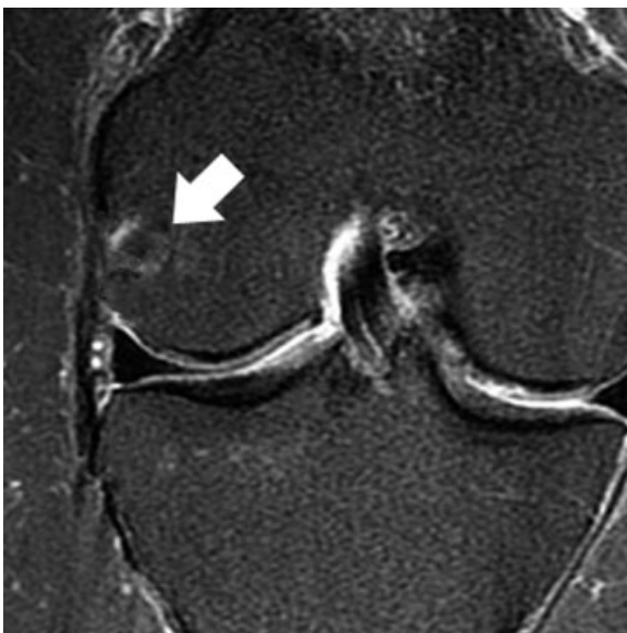
Fig. 2 T2-weighted MR scan with hypointense core plus hyperintense surrounding the lesion (arrow). MR, magnetic resonance.

The patient underwent a surgical LFC curettage and synovectomy with synovial biopsy that was found to be inflamed and hypertrophied with multiple “rice bodies” (► Fig. 3 ). The histopathologic exam revealed granulomatous inflammation with caseous necrosis, suggestive of TB. Polymerase chain reaction (PCR) test for Mycobacterium tuberculosis DNA was positive, resulting in an isoniazid monoresistance profile. The patient was treated with a polytherapy consisting of rifampin, pyrazinamide, and