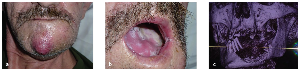
Fig. 1: a, b, c: Clinical appearance and dental CT of the patient.

A supraomohyoidale neck dissection on the right, a radical neck dissection on the left, a 3/4 resection of the tongue, a complete resection of the mouth floor was performed. The lower lip with its orbicular muscle could be preserved. Soft tissue defect size was 351 cm 2 . An ALTP flap from the left thigh sized 28x14 cm was harvested. Primary closure of the defect was possible. Left external carotid artery and vein were used for end- to side anastomosis. The flap