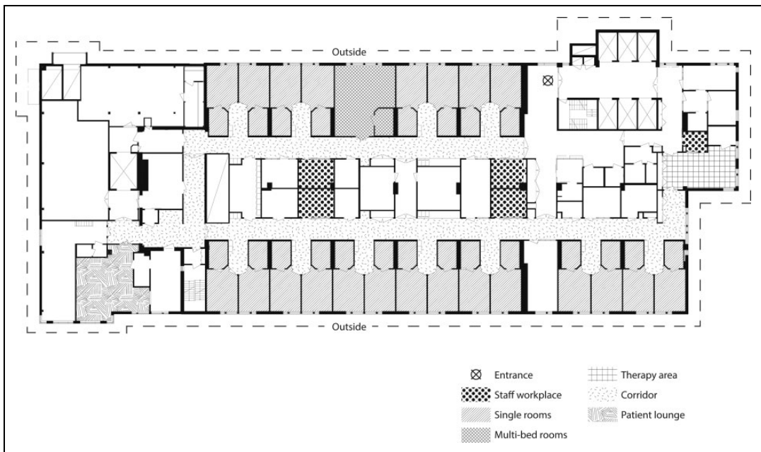
Figure 1. Scheme of the selected stroke unit.

This study is part of a larger study, where we explore different factors in the physical environment that may influence patients and staff at a stroke unit.