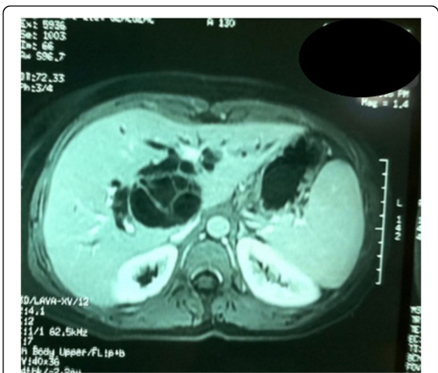
Fig. 1 Partitioned cystic lesion of segment I of the liver with dilated intrahepatic bile ducts

laparotomy by subcostal incision; the exploration noted a micronodular liver and the opening of her CBD allowed the extraction of membranes with a mucinous fluid issue, which raised questions about the diagnosis of hydatid cyst (Figs. 3 and 4). A t-tube was placed in the CBD at the end of the operation. A histological study of the membranes as well as liver biopsies indicated a biliary cystadenoma without signs of malignancy associated to biliary cirrhosis. Postoperative cholangiography performed 1 month later revealed the persistence of the biliary cystadenoma (Fig. 5).