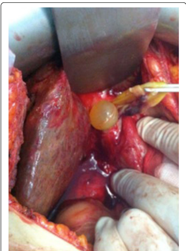
Fig. 3 Operative view after opening of the main bile duct showing vesicles with mucinous contents as well as membranes traversed by vessels

amelioration of blood tests. In fact, she underwent a left hepatectomy enlarged to segment I by laparotomy, because the cyst was ruptured in the posterior wall of the left hepatic canal, with large fistula, near the biliary convergence; a simple enucleation was impossible due to posterior location of the cyst and the adhesions of