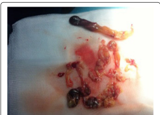
Fig. 4 Content of the cyst (membranes)

amelioration of blood tests. In fact, she underwent a left hepatectomy enlarged to segment I by laparotomy, because the cyst was ruptured in the posterior wall of the left hepatic canal, with large fistula, near the biliary convergence; a simple enucleation was impossible due to posterior location of the cyst and the adhesions of