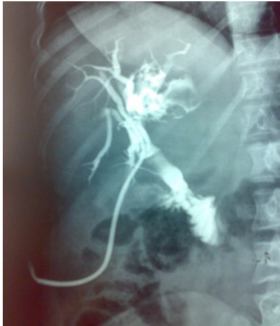
Fig. 5 Postoperative cholangiography showing the persistence of the biliary cystadenoma

anterior surgeries. Her postoperative follow-up was simple and a histological study of the specimen confirmed the diagnosis of biliary cystadenoma without signs of malignancy.