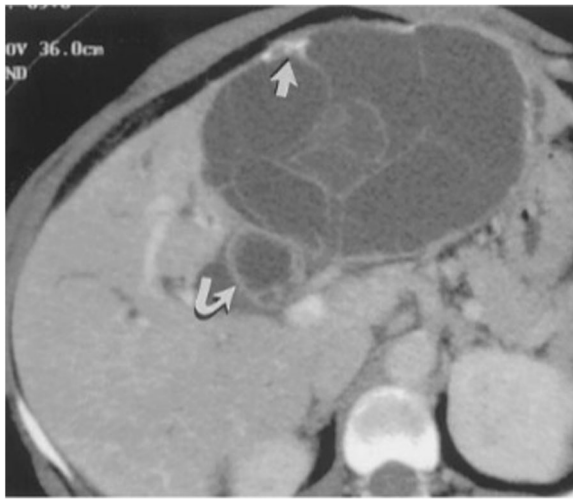
Fig. 6 Computed tomography scan shows a multilocular cyst with septations and mural calcifications ( straight arrow ) with biliary duct dilatation and extension of the cyst into the left hepatic and common bile ducts ( curved arrow ) [9]