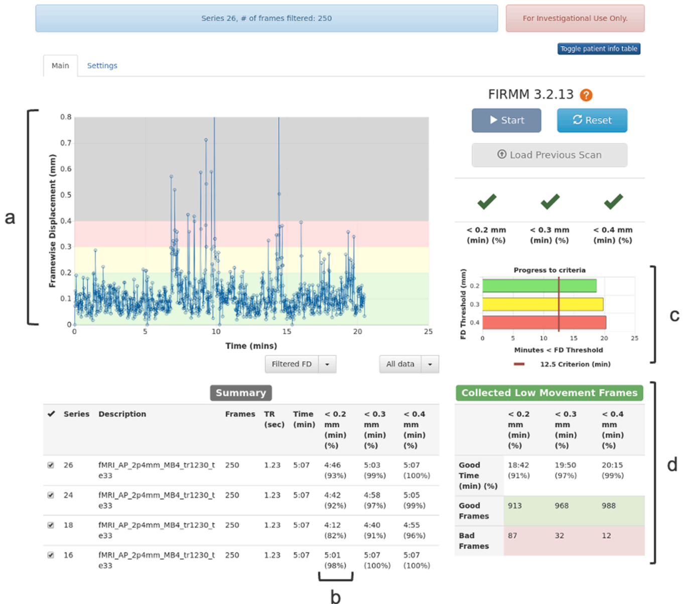
Fig. 1. FIRMM prototype software available in 2017 and used for data collection in Cohorts 4 and 5. (a) Motion Trace: plot of FD values for each frame. (b) Minutes and percentage of fMRI data below 0.2 mm for a given scan run; (c) Progress to criteria: total minutes of data collected compared to a predetermined minimum goal; and (d) Collected Low Movement Frames: running total of minutes, percent, and number of frames of data below the set threshold.

For Cohorts 1–4, MRI data were acquired at the Mallinckrodt Institute of Radiology at WUSM or at St. Louis Children’s Hospital (Smyser et al., 2010, 2016). MRI data for Cohorts 1–3 were acquired on Siemens Trio 3 T MRI scanners with a custom 2-channel quad infant head coil manufactured by Advanced Imaging Research Inc. Functional images were acquired using a BOLD contrast-sensitive echo planar sequence; acquisition parameters can be found in Supplementary Table 4. For Cohort 2, rescans were conducted within several days of the initial scan if movement criteria were not met after data processing. Specifically, motion censoring procedures were applied such that frames with