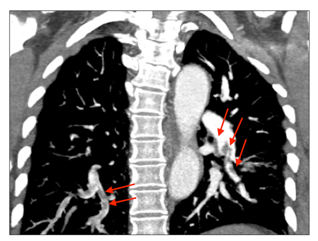
Figure 3. Coronal section CTPA shows extensive pulmonary emboli in segmental and subsegmental branches in both lower lobes.

BNT162b2 mRNA COVID-19 (Pfizer-BioNTech) is currently used for SARS-CoV-2 massive vaccination campaigns worldwide. A medium of 2 months safety profile in 43 252 participants was provided by the BNT162b2 mRNA COVID-19 vaccine trial, which