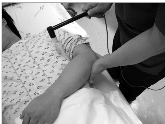
Fig. 1. Biceps T- reflex tests were performed using a hand operated electric reflex hammer in the relaxed supine position on the affected side.

To evaluate the T-reflex of biceps brachii muscle, electromyogram Dantec Keypoint (Medtronic Functional Diagnostics, Skovlunde, Denmark) was used. The conditions were: 10 msec/division in speed, 0.2-2 mV/division in sensitivity and 10 Hz-10 kHz in the frequency range. The tendon area was mildly hit by an electric reflex hammer to arouse T-reflex and the result was recorded by us-