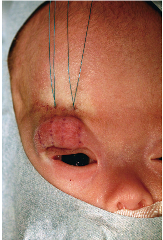
Fig. 2. Intraoperative image of thread lifting. Two sutures were placed subcutaneously to form rectangular shapes between the eyelid and eyebrow. Threads were tightened to ensure the optimal position.

A 3-0 absorbable monofilament suture of which both ends were equipped with straight needles (Maxon, Covidien; Medtronic PLC, Dublin, Ireland) was used for lifting the upper eyelid. Sutures were placed subcutaneously to form rectangular shapes between the drooped eyelid and eyebrow. First, the needle was inserted at the side of the eyelid margin, then pulled out from the upper margin of the eyebrow. Second, another needle was inserted at the same hole in the eyelid margin, passed through transversely, pulled out from another site of the eyelid margin, then passed through upward in parallel with the first suture, and passed through transversely along the upper margin of eyebrow. Finally, the ends of