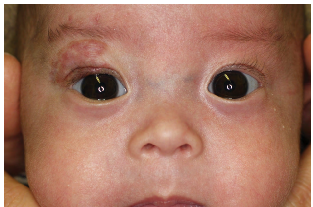
Fig. 3. Two months (59 d) postoperative views showing regression of IH.

the suture were tightened to ensure the optimal position of the drooping eyelid and knotted. In this case, 2 sutures were used as the eyelid of the infant was too small to apply a greater number of sutures (Fig. 2).