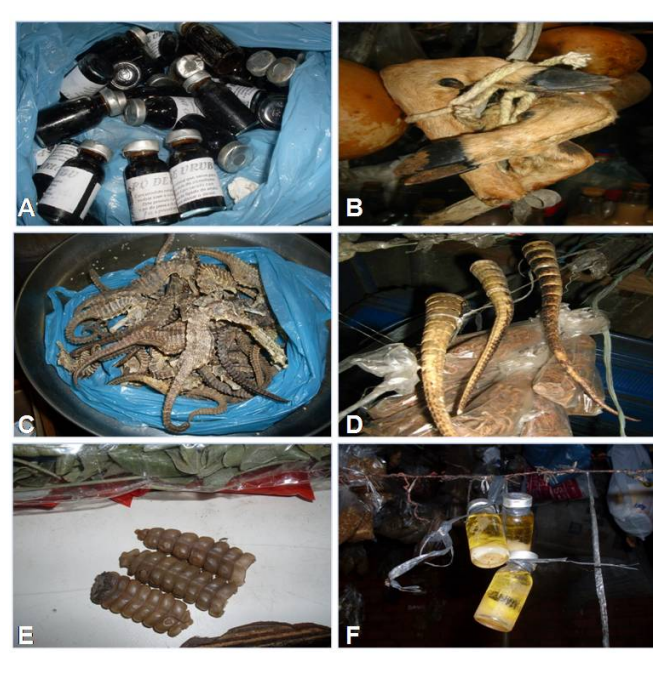
Figure 3 Examples of animal products used as remedies in that are sold in public markets in Crato and Juazeiro do Norte. A: Liver powder of Coragyps atratus, B: Hoof of Mazama sp., C: Dried Seahorses (Hippocampus reidi), D: Tail of Euphractus sexcinctus, E: Rattle of Crotalus durissus, F: Fat of Tupinambis merianae (Photos: Samuel C Ribeiro).

asthma, while its fat is used in to treat rheumatism and bruises. The fat from Hoplias malabaricus is utilized in the treatment of inflammations, urinary infections, and earaches.