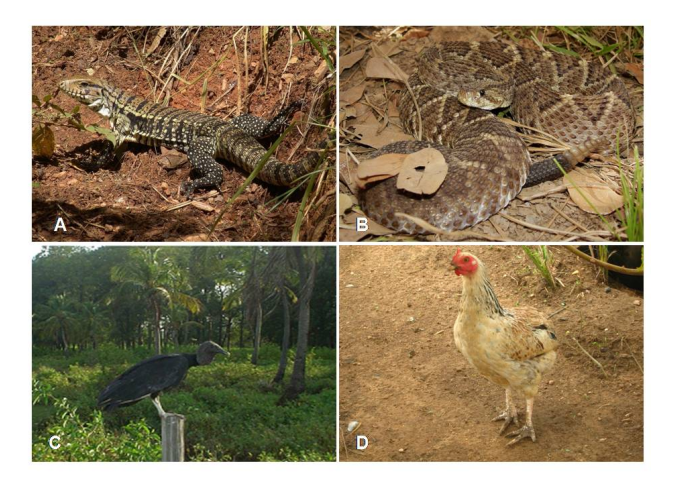
Figure 2 Examples of animals used as medicine that are sold in public markets in Crato and Juazeiro do Norte. A: Tupinambis merianae, B: Crotalus durissus, Gallus domesticus, D: Coragyps atratus.

The species most frequently cited in the present study were: Tupinambis merianae (n = 20) and P. tuberosus and Crotalus durissus (n = 18) (Figure 2). These species are similarly widely used in alternative medicinal practices in other regions of Brazil [16-18,22,41]. Most of the animal species cited are only found wild in nature; only five