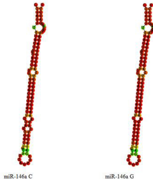
Figure 2: Sequence variations in the miR-146a can translate into structural alterations. The RNA secondary structure was predicted by RNAHYbrid. Only the most stable secondary structures with the lowest free energy are depicted.