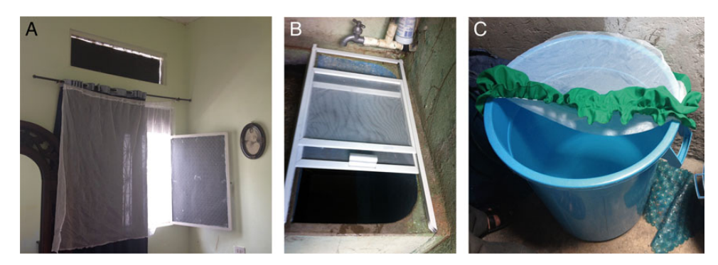
Figure 2. Curtains in windows, rectangular container cover and circular container cover. The Figure shows three intervention tools. (A) a curtain inside a household in Girardot. (B) the rectangular water container cover for rectangular or square cement containers of at least 200 L capacity; the cover is made of an aluminum frame, LLIN netting and a sliding mechanism for opening both doors. (C) the circular cover made of rubric, LLIN netting and rubber, for plastic and cement cylindrical containers that can store more than 200 L. This figure is available in black and white in print and in colour at Transactions online.