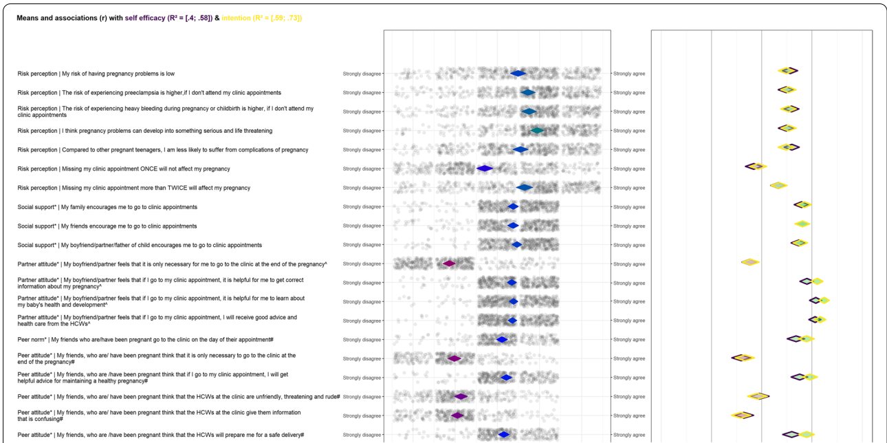
Fig. 1. Confidence Interval Based Estimation of Relevance (CIBER) plot showing the mean scores of psychosocial sub-determinants (knowledge, risk perception, social support; peer, family, and partner attitudes and participant attitudes) and their associations with the intention and self-efficacy to attend antenatal appointments