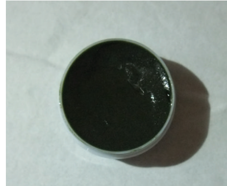
FIGURE 1: SHI DU RUAN GAO contains indigo naturalis (Qing Dai), Cortex Phellodendri (Huang Bai), Gypsum fibrosum preparatum (Duan Shi Gao), Calamine (Lu Gan Shi), and Galla chinensis (Wu Bei Zi).

Patients were scheduled to have an initial visit and then follow-up visits at 4 and 8 weeks. At each visit, psoriasis areas were visualized and measured. General condition of patients such as itching was evaluated. The efficacy assessments consisted of Total Severity Score (TSS, sum of erythema, scaling, and plaque elevation, on a 0 to 4 scale), each individual score, Investigator Global Assessment (IGA), which