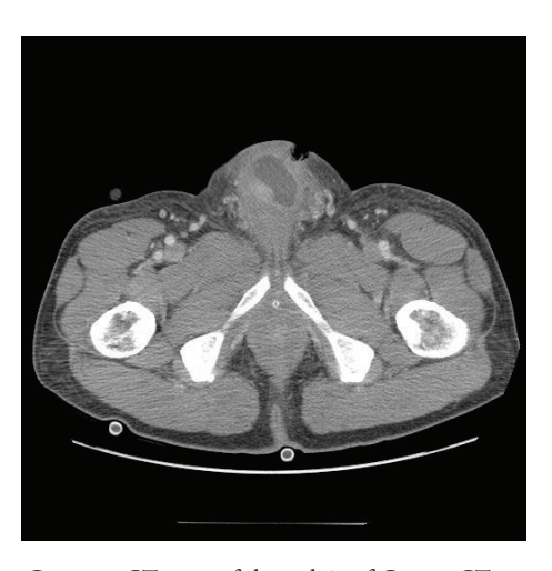
FIGURE 1: Contrast CT scan of the pelvis of Case 1. CT scan showed abscesses within or adjacent to the bilateral corpus cavernosa. The largest abscess was located in the left corpus cavernosum, measuring 4.8 \times 2.8 \times 4.4\,\mathrm{cm} . The additional left corpus cavernosum and right corpus cavernosum abscesses measured 2.4\,\mathrm{cm} and 1.6\,\mathrm{cm} , respectively, in longest diameter on coronal views.

Despite negative CT imaging, the patient was immediately taken to the operating room for incision and drainage after progressively worsening in the emergency department. A 17-French flexible cystoscopy confirmed no evidence of urethral erosion, injury, or stricture. After placement of a Foley catheter, a 7 cm incision along the right lateral aspect of the penis was performed whereby pus was drained. The abscess cavity was copiously irrigated and packed wet to dry. There was no involvement of the corpora or urethra. His postoperative course was complicated by pulmonary edema managed conservatively with diuresis. Initially, he was started on vancomycin (1.5 g every 8 hours) and ertapenem (1 g IV every 24 hours) antibiotics until his intraoperative wound culture grew sensitive Group A Streptococcus spp. He was discharged home with amoxicillin/clavulanate 875 mg/125 mg twice daily for 14 days based off antibiotic sensitivities.